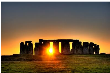
The sun sets on Stonehenge in England.