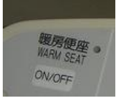
a seat warmer

Japan has perhaps the most technologically advanced toilets in the world. The one shown below comes with remote control and buttons featuring:-