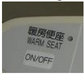
a seat warmer

Japan has perhaps the most technologically advanced toilets in the world. The one shown below comes with remote control and buttons featuring:-