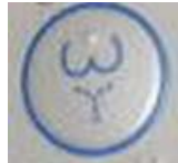
bottom washer (bidet)