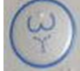
bottom washer (bidet)