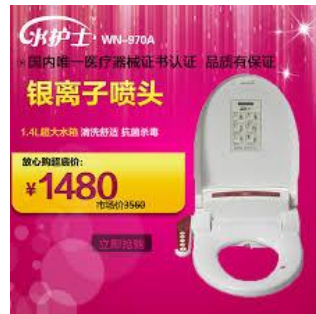
Example of print advertisement for Japanese toilet