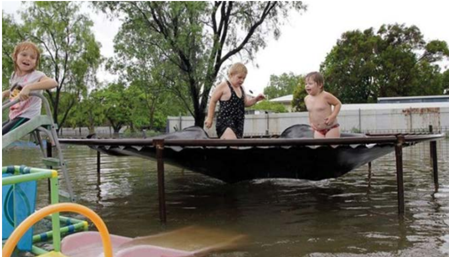
Kids playing in Rockhampton during 2013 Queensland flooding

homes of 12 million people, destroyed 2.2 million hectares of crops and killed 450,000 head of livestock. United Kingdom aid charities provided one million people with food, 510,000+ with clean water, 290,000 with emergency shelter and 200,000 people were given mosquito nets to prevent malaria ( Disasters Emergency Committee, 2012 ).