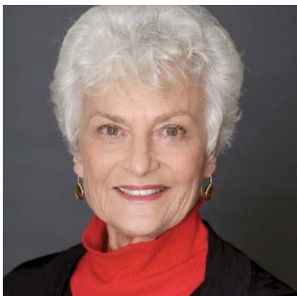
Professor Fiona Stanley, AC FAA FASSA is Patron and former Director of the Telethon Kids Institute, Distinguished Research Professor, The University of Western Australia, Vice Chancellor's Fellow, The University of Melbourne. She was named Australian of the Year in 2003. She is a member of Doctors for the Environment Australia's Scientific Advisory Committee.

Failure to act responsibly will have dire consequences for our children's wellbeing, and the impacts of inadequate action for their children verge on the apocalyptic and are too scary to contemplate.