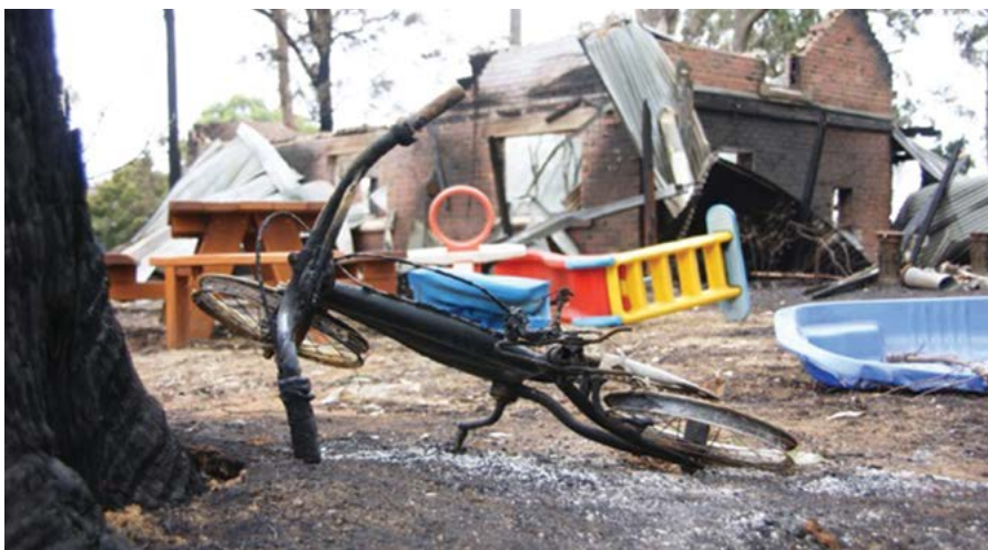
Home and family belongings destroyed by the Kinglake bushfire 10 February 2009

After Hurricane Andrew in south-eastern USA, it was found that children were 2-3 times more likely than adults to suffer