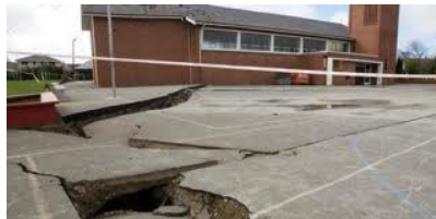
Six Christchurch schools have been significantly damaged following the massive earthquake.