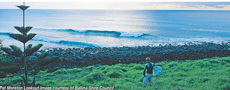
Pat Moreton Lookout