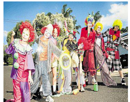
KIDS ON STAGE: A new theatre school will soon open its doors in Nedlands